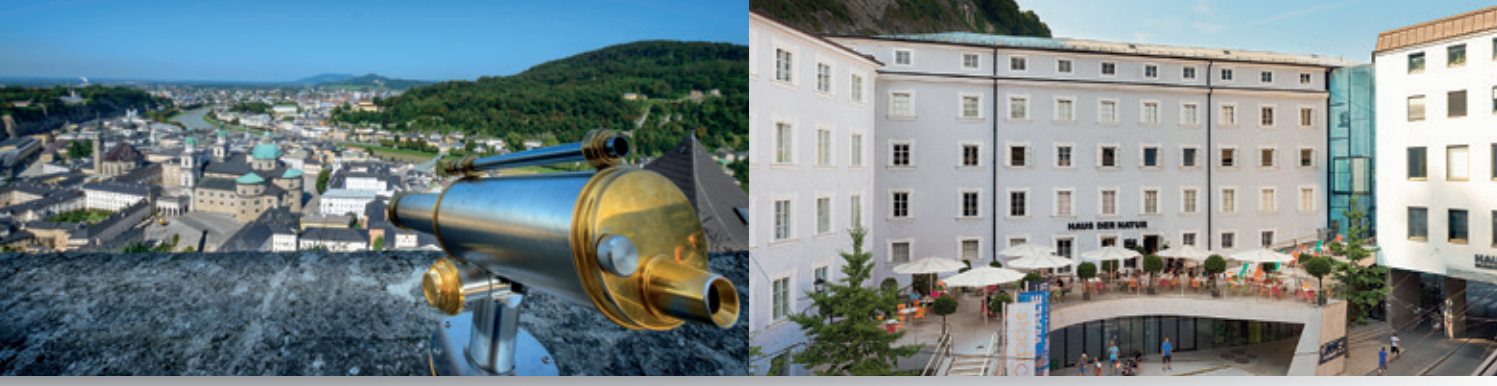
View of the historic district from the Mönchsberg