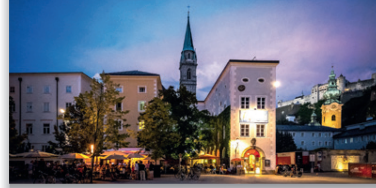
Museum of Modern Art Salzburg - Rupertinum