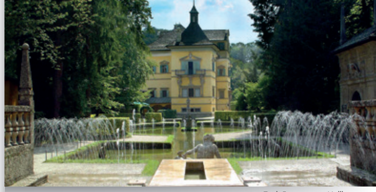
Trick Fountains at Hellbrunn